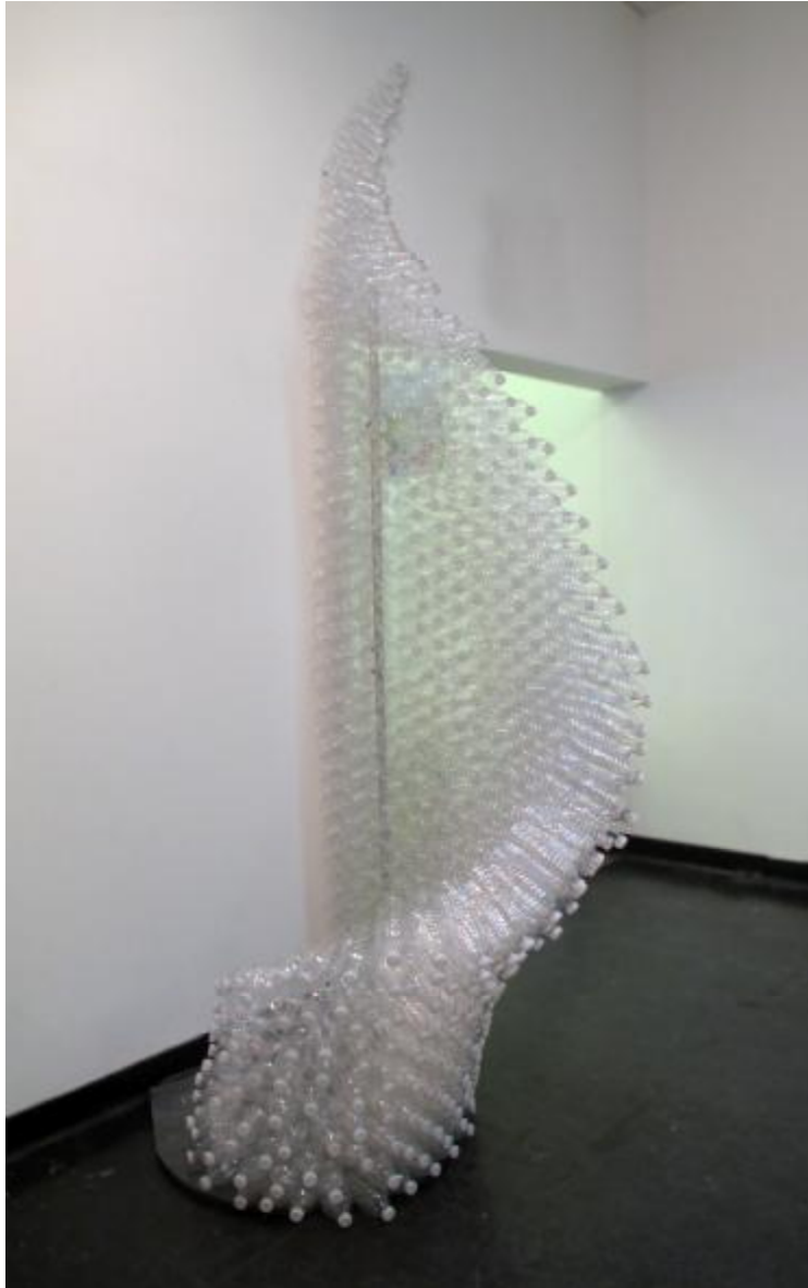
Flotsam Reef Spiral , plastic bottles, staples, 10' x 3.5' x 3.5'