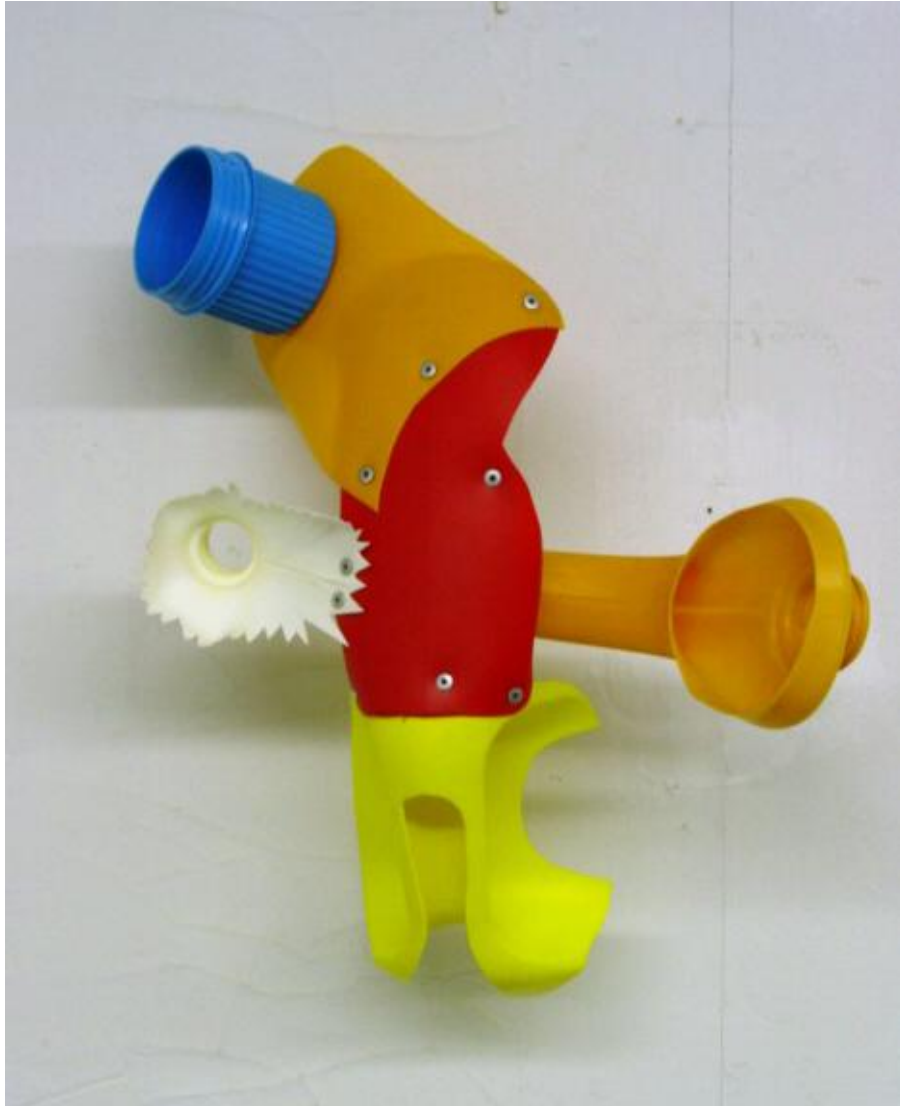
untitled (centered), plastic rivets, 14 x 11 x 8"