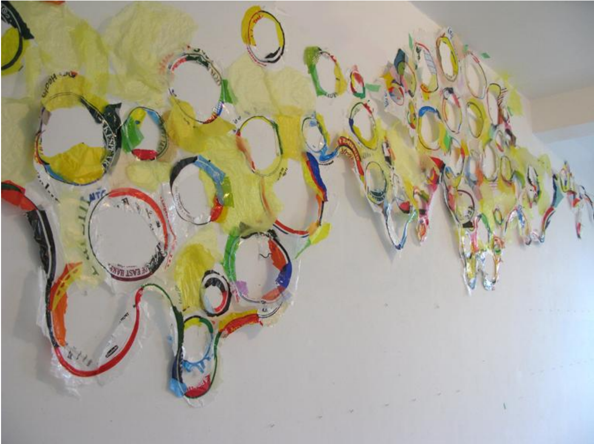
East Otisserie , plastic bags, 5' x 20'