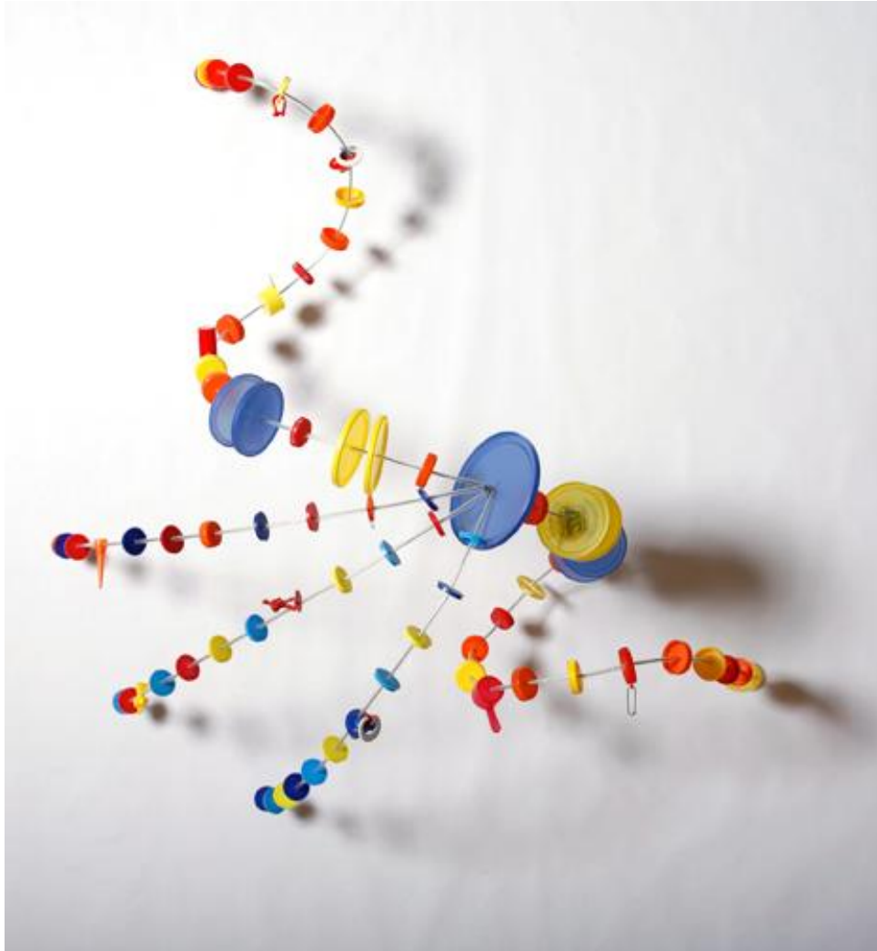
Cancan #20 , plastic bottle caps, lids, and straws, detail from 12' x 32' installation