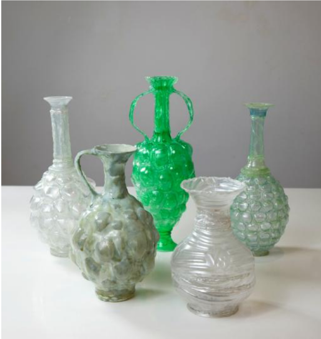
5 Vessels, plastic from discarded bottles